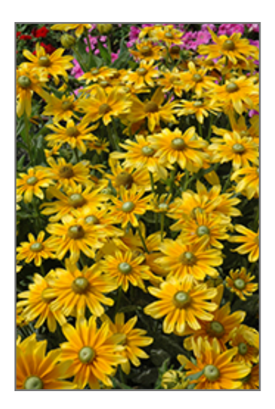
Prairie Sun Coneflower flowers