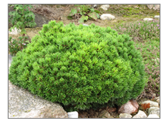
Mops Mugo Pine

Mops Mugo Pine is a dwarf conifer which is primarily valued in the landscape or garden for its ornamental globe-shaped form. It has emerald green evergreen foliage. The needles remain emerald green throughout the winter.