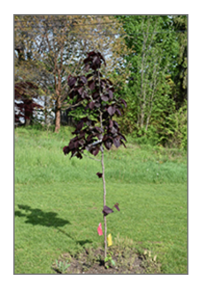
Te-Terra Red Purple-leaved Turkish Hazelnut

Te-Terra Red Purple-leaved Turkish Hazelnut is a deciduous tree with an upright spreading habit of growth. Its average texture blends into the landscape, but can be balanced by one or two finer or coarser trees or shrubs for an effective composition.