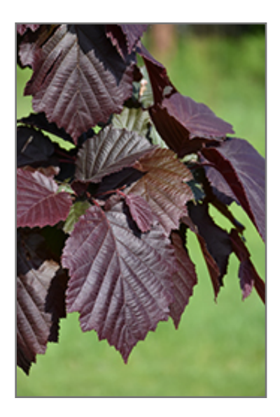
Te-Terra Red Purple-leaved Turkish Hazelnut foliage