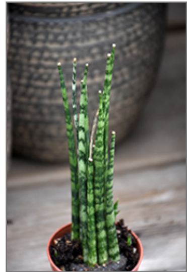
Mikado Cylindrical Snake Plant

When grown indoors, Mikado Cylindrical Snake Plant can be expected to grow to be about 3 feet tall at maturity, with a spread of 18 inches. It grows at a slow rate, and under ideal conditions can be expected to live for approximately 10 years. This houseplant will do well in a location that gets either direct or indirect sunlight, although it will usually require a more brightly-lit environment than what artificial indoor lighting alone can provide. It prefers dry to average moisture levels with very well-drained soil, and may die if left in standing water for any length of time. This plant should be watered when the surface of the soil gets dry, and will need watering approximately once each week. Be aware that your particular watering schedule may vary depending on its location in the room, the pot size, plant size and other conditions; if in doubt, ask one of our experts in the store for advice. It is not particular as to soil pH, but grows best in sandy soil. Contact the store for specific recommendations on pre-mixed potting soil for this plant. Be warned that parts of this plant are known to be toxic to humans and animals, so special care should be exercised if growing it around children and pets.