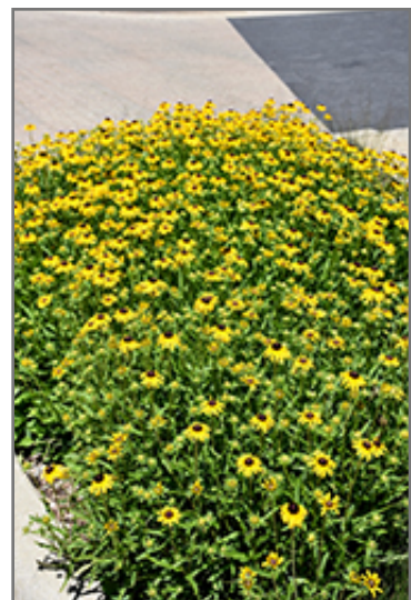
Viette's Little Suzy Coneflower in bloom