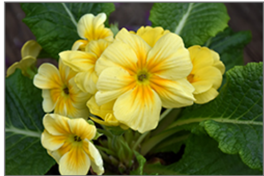
Primrose flowers