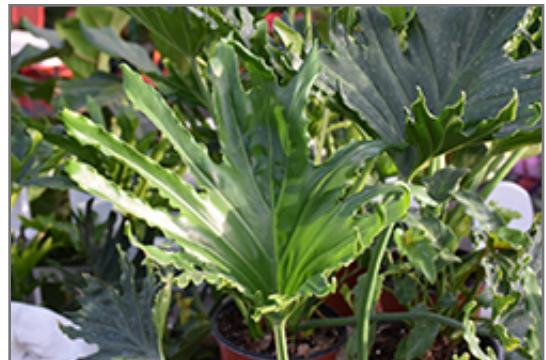
Lickety Split Philodendron foliage