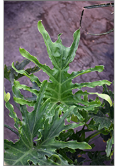
Lickety Split Philodendron foliage

This is a dense herbaceous evergreen houseplant with a spreading, ground-hugging habit of growth. Its wonderfully bold, coarse texture is quite ornamental and should be used to full effect. This plant should not require much pruning, except when necessary to keep it looking its best.