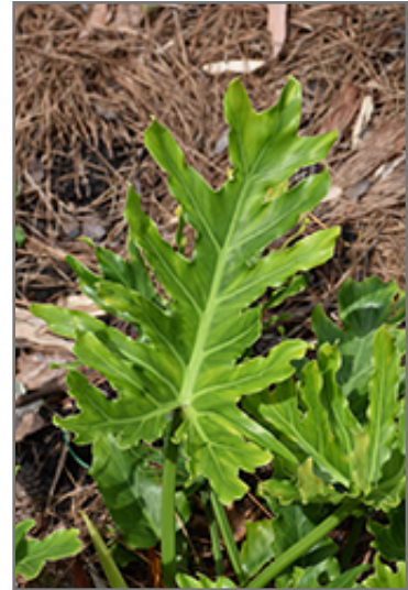
Little Hope Philodendron foliage

When grown indoors, Little Hope Philodendron can be expected to grow to be about 24 inches tall at maturity, with a spread of 24 inches. It grows at a fast rate, and under ideal conditions can be expected to live for approximately 10 years. This houseplant performs well in both bright or indirect sunlight and strong artificial light, and can therefore be situated in almost any well-lit room or location. It does best in average to evenly moist soil, but will not tolerate standing water. The surface of the soil shouldn't be allowed to dry out completely, and so you should expect to water this plant once and possibly even twice each week. Be aware that your particular watering schedule may vary depending on its location in the room, the pot size, plant size and other conditions; if in doubt, ask one of our experts in the store for advice. It is not particular as to soil type or pH; an average potting soil should work just fine. Be warned that parts of this plant are known to be toxic to humans and animals, so special care should be exercised if growing it around children and pets.