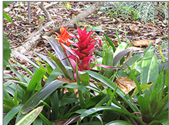
Guzmania Bromeliad flowers

When grown indoors, Guzmania Bromeliad can be expected to grow to be about 14 inches tall at maturity, with a spread of 18 inches. It grows at a slow rate, and under ideal conditions can be expected to live for approximately 5 years. This houseplant performs well in both bright or indirect sunlight and strong artificial light, and can therefore be situated in almost any well-lit room or location. It prefers dry to average moisture levels with very well-drained soil, and may die if left in standing water for any length of time. This plant should be watered when the surface of the soil gets dry, and will need watering approximately once each week. Be aware that your particular watering schedule may vary depending on its location in the room, the pot size, plant size and other conditions; if in doubt, ask one of our experts in the store for advice. It is not particular as to soil type or pH; an average potting soil should work just fine.