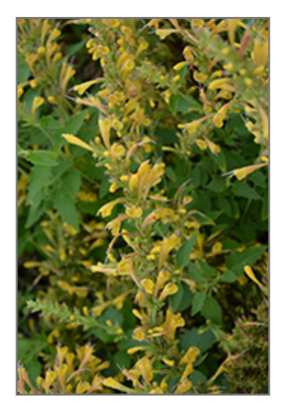
Kudos Yellow Hyssop flowers