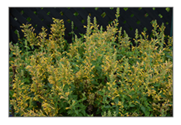
Kudos Yellow Hyssop flowers

This is a relatively low maintenance plant, and is best cleaned up in early spring before it resumes active growth for the season. It is a good choice for attracting bees, butterflies and hummingbirds to your yard, but is not particularly attractive to deer who tend to leave it alone in favor of tastier treats. It has no significant negative characteristics.