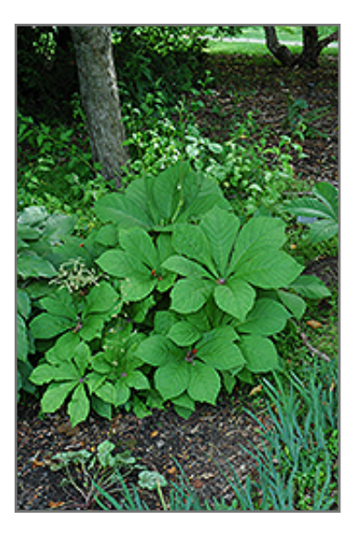
Fingerleaf Rodgersia foliage

This attractive shade-loving groundcover is grown both for its large palm-like leaves that emerge a deep chocolate color, as well as the plumes of airy white flowers that tower above; must have evenly moist soil