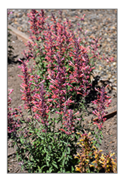
Kudos Ambrosia Hyssop flowers

Easy to grow perennial flowers on airy spikes add lovely texture to any garden; pale orange buds open to rosy pink and cream blooms; a favorite for native butterflies and hummingbirds; aromatic, licorice scented foliage for a fragrant garden