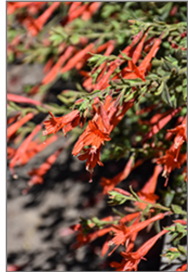
Orange Carpet Creeping Hummingbird Trumpet flowers

Orange Carpet Creeping Hummingbird Trumpet is a fine choice for the garden, but it is also a good selection for planting in outdoor pots and containers. Because of its trailing habit of growth, it is ideally suited for use as a 'spiller' in the 'spiller-thriller-filler' container combination; plant it near the edges where it can spill gracefully over the pot. Note that when growing plants in outdoor containers and baskets, they may require more frequent waterings than they would in the yard or garden. Be aware that in our climate, most plants cannot be expected to survive the winter if left in containers outdoors, and this plant is no exception. Contact our experts for more information on how to protect it over the winter months.