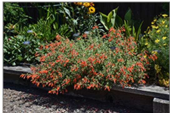
Orange Carpet Creeping Hummingbird Trumpet in bloom