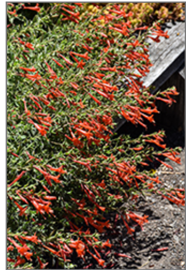
Orange Carpet Creeping Hummingbird Trumpet flowers

Orange Carpet Creeping Hummingbird Trumpet is a dense herbaceous evergreen perennial with a trailing habit of growth, eventually spilling over the edges of hanging baskets and containers. Its relatively fine texture sets it apart from other garden plants with less refined foliage.