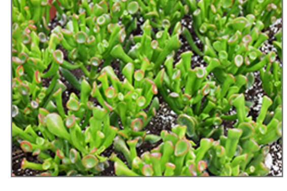
Ogre Ears Jade Plant

Ogre Ears Jade Plant is bathed in stunning corymbs of white star-shaped flowers with pink overtones at the ends of the branches in late fall. The flowers are excellent for cutting. Its attractive succulent narrow leaves remain dark green in colour with distinctive red edges throughout the year.