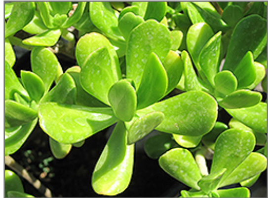
Jade Plant foliage

This is a multi-stemmed evergreen houseplant with an upright spreading habit of growth. This plant can be pruned at any time to keep it looking its best.