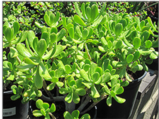
Jade Plant