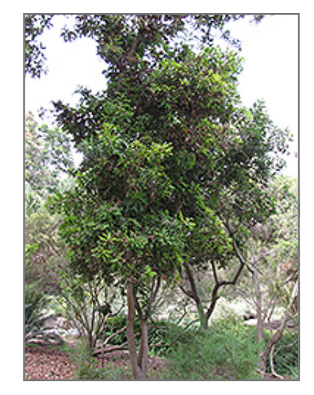
Firewheel Tree

This is a relatively low maintenance tree, and usually looks its best without pruning, although it will tolerate pruning. It has no significant negative characteristics.