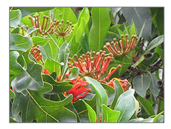
Firewheel Tree flowers

Firewheel Tree is recommended for the following landscape applications;