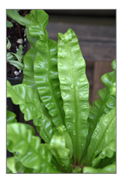
Crispy Wave Fern foliage

When grown indoors, Crispy Wave Fern can be expected to grow to be about 24 inches tall at maturity, with a spread of 18 inches. It grows at a slow rate, and under ideal conditions can be expected to live for approximately 15 years. This houseplant performs well in both bright or indirect sunlight and strong artificial light, and can therefore be situated in almost any well-lit room or location. It does best in average to evenly moist soil, but will not tolerate standing water. The surface of the soil shouldn't be allowed to dry out completely, and so you should expect to water this plant once and possibly even twice each week. Be aware that your particular watering schedule may vary depending on its location in the room, the pot size, plant size and other conditions; if in doubt, ask one of our experts in the store for advice. It is not particular as to soil pH, but grows best in rich soil. Contact the store for specific recommendations on pre-mixed potting soil for this plant.