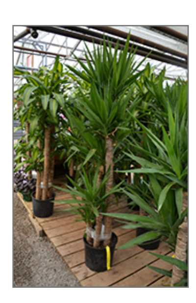
Spineless Yucca

When grown indoors, Spineless Yucca can be expected to grow to be about 4 feet tall at maturity, with a spread of 4 feet. It grows at a slow rate, and under ideal conditions can be expected to live for approximately 20 years. This houseplant requires direct sun for optimal performance, and should therefore be situated in a room that gets bright sunlight for a good part of the day; it is not a good choice for rooms lit only by artificial light. It prefers dry to average moisture levels with very well-drained soil, and may die if left in standing water for any length of time. This plant should be watered when the surface of the soil gets dry, and will need watering approximately once each week. Be aware that your particular watering schedule may vary depending on its location in the room, the pot size, plant size and other conditions; if in doubt, ask one of our experts in the store for advice. It is not particular as to soil pH, but grows best in sandy soil. Contact the store for specific recommendations on pre-mixed potting soil for this plant.