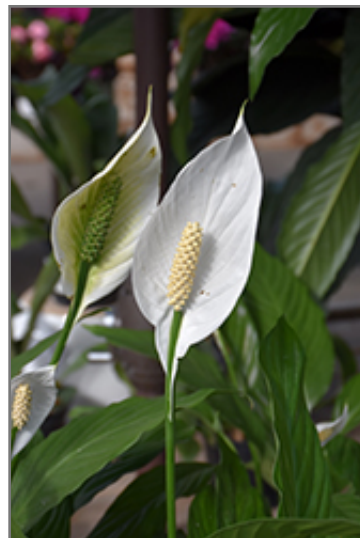
Peace Lily flowers

When grown indoors, Peace Lily can be expected to grow to be about 30 inches tall at maturity, with a spread of 30 inches. It grows at a medium rate, and under ideal conditions can be expected to live for approximately 10 years. This houseplant performs well in both bright or indirect sunlight and strong artificial light, and can therefore be situated in almost any well-lit room or location. It prefers to grow in average to moist soil. The surface of the soil shouldn't be allowed to dry out completely, and so you should expect to water this plant once and possibly even twice each week. Be aware that your particular watering schedule may vary depending on its location in the room, the pot size, plant size and other conditions; if in doubt, ask one of our experts in the store for advice. It is particular about its soil conditions, with a strong preference for rich, acidic soil. Contact the store for specific recommendations on pre-mixed potting soil for this plant. Be warned that parts of this plant are known to be toxic to humans and animals, so special care should be exercised if growing it around children and pets.