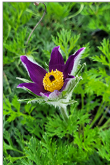
Pasqueflower flowers