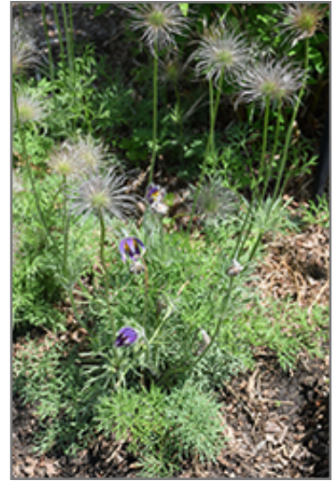
Pasqueflower fruit

This plant does best in full sun to partial shade. It is very adaptable to both dry and moist growing conditions, but will not tolerate any standing water. It is considered to be drought-tolerant, and thus makes an ideal choice for a low-water garden or xeriscape application. It is not particular as to soil type or pH. It is somewhat tolerant of urban pollution. Consider covering it with a thick layer of mulch in winter to protect it in exposed locations or colder microclimates. This species is not originally from North America.