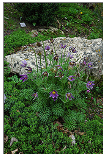
Pasqueflower in bloom