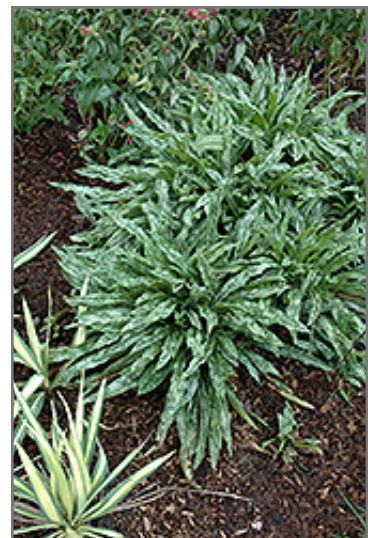
Cevennensis Lungwort