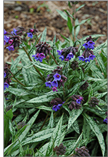
Cevennensis Lungwort flowers