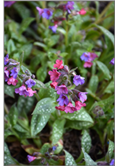
Victorian Brooch Lungwort flowers