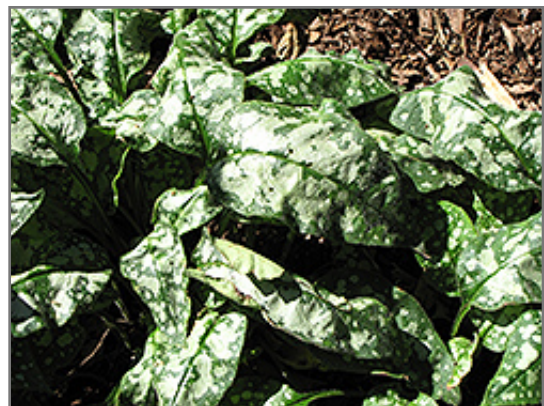
Victorian Brooch Lungwort foliage