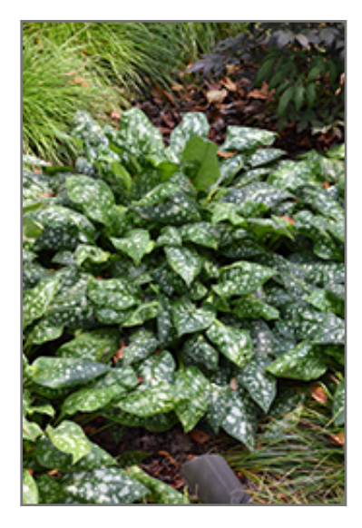
Sissinghurst White Lungwort