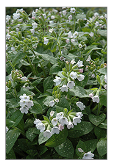
Sissinghurst White Lungwort flowers