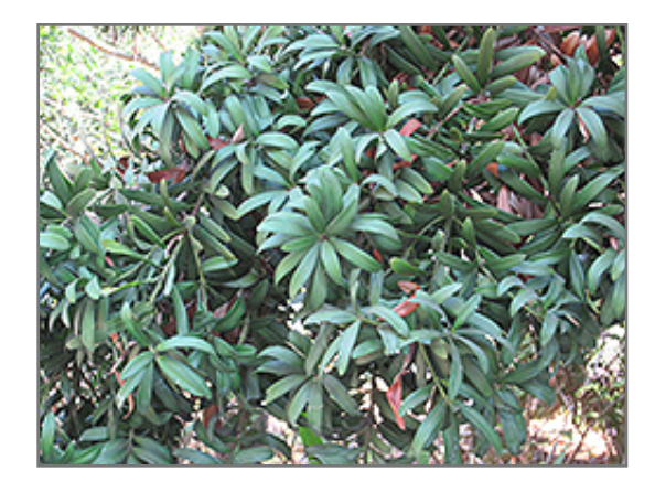
Yellowwood foliage