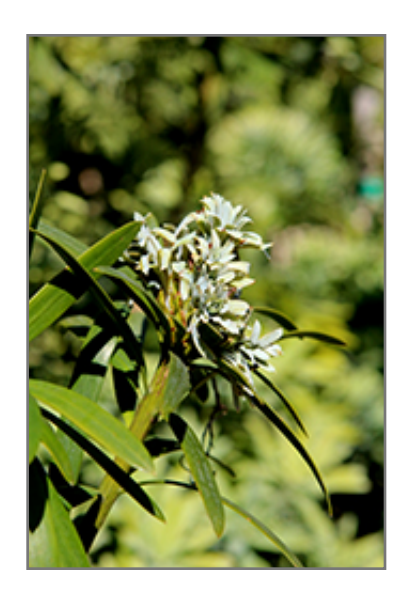
Yellowwood flowers

This tree does best in full sun to partial shade. It does best in average to evenly moist conditions, but will not tolerate standing water. It is not particular as to soil type or pH. It is somewhat tolerant of urban pollution. This species is not originally from North America.