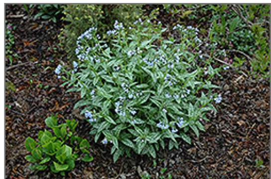
Roy Davidson Lungwort in bloom