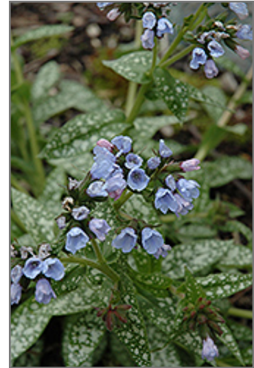
Roy Davidson Lungwort flowers