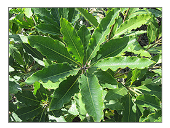
Victorian Box foliage