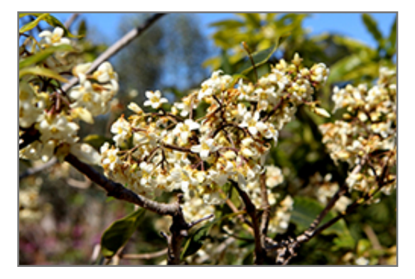
Victorian Box flowers

Victorian Box is a dense multi-stemmed evergreen tree with an upright spreading habit of growth. Its average texture blends into the landscape, but can be balanced by one or two finer or coarser trees or shrubs for an effective composition.