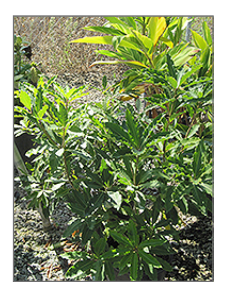
Victorian Box

This tree does best in full sun to partial shade. It does best in average to evenly moist conditions, but will not tolerate standing water. It is not particular as to soil type or pH. It is somewhat tolerant of urban pollution. This species is not originally from North America, and parts of it are known to be toxic to humans and animals, so care should be exercised in planting it around children and pets.