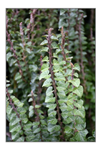
Little Fantasy Ivy foliage

When grown indoors, Little Fantasy Ivy can be expected to grow to be about 30 inches tall at maturity, with a spread of 3 feet. It grows at a medium rate, and under ideal conditions can be expected to live for approximately 30 years. This houseplant performs well in both bright or indirect sunlight and strong artificial light, and can therefore be situated in almost any well-lit room or location. It prefers to grow in average to moist soil. The surface of the soil shouldn't be allowed to dry out completely, and so you should expect to water this plant once and possibly even twice each week. Be aware that your particular watering schedule may vary depending on its location in the room, the pot size, plant size and other conditions; if in doubt, ask one of our experts in the store for advice. It is not particular as to soil pH, but grows best in rich soil. Contact the store for specific recommendations on pre-mixed potting soil for this plant. Be warned that parts of this plant are known to be toxic to humans and animals, so special care should be exercised if growing it around children and pets.