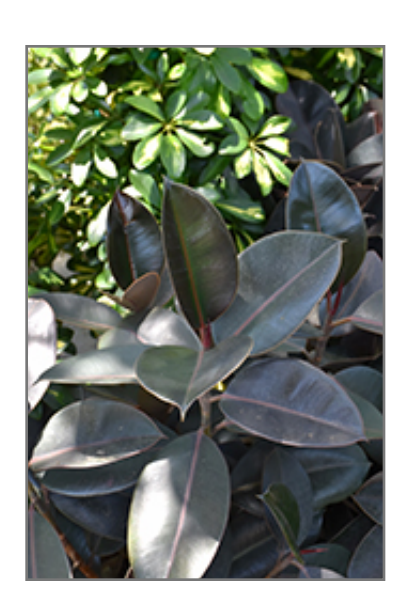
Burgundy Bush Rubber Plant foliage

When grown indoors, Burgundy Bush Rubber Plant can be expected to grow to be about 8 feet tall at maturity, with a spread of 6 feet. It grows at a medium rate, and under ideal conditions can be expected to live for approximately 50 years. This houseplant will do well in a location that gets either direct or indirect sunlight, although it will usually require a more brightly-lit environment than what artificial indoor lighting alone can provide. It prefers dry to average moisture levels with very well-drained soil, and may die if left in standing water for any length of time. This plant should be watered when the surface of the soil gets dry, and will need watering approximately once each week. Be aware that your particular watering schedule may vary depending on its location in the room, the pot size, plant size and other conditions; if in doubt, ask one of our experts in the store for advice. It is not particular as to soil type or pH; an average potting soil should work just fine.