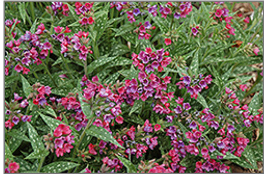
Raspberry Splash Lungwort flowers