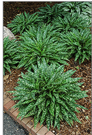
Raspberry Splash Lungwort