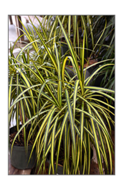
Kiwi Dracaena

When grown indoors, Kiwi Dracaena can be expected to grow to be about 6 feet tall at maturity, with a spread of 3 feet. It grows at a medium rate, and under ideal conditions can be expected to live for approximately 10 years. This houseplant performs well in both bright or indirect sunlight and strong artificial light, and can therefore be situated in almost any well-lit room or location. It does best in average to evenly moist soil, but will not tolerate standing water. The surface of the soil shouldn't be allowed to dry out completely, and so you should expect to water this plant once and possibly even twice each week. Be aware that your particular watering schedule may vary depending on its location in the room, the pot size, plant size and other conditions; if in doubt, ask one of our experts in the store for advice. It is not particular as to soil type or pH; an average potting soil should work just fine.