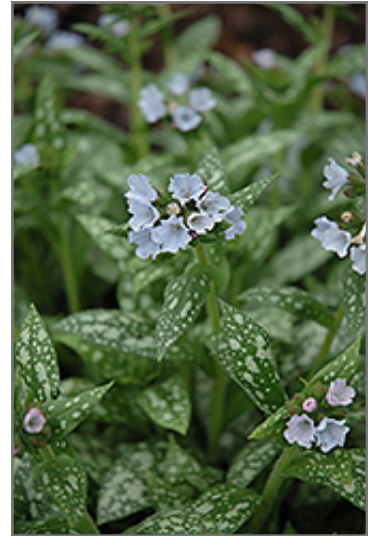
Opal Lungwort flowers