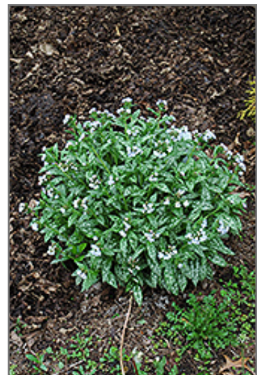
Opal Lungwort in bloom