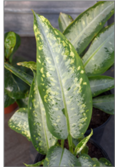
Panther Dieffenbachia foliage

When grown indoors, Panther Dieffenbachia can be expected to grow to be about 5 feet tall at maturity, with a spread of 3 feet. It grows at a medium rate, and under ideal conditions can be expected to live for approximately 10 years. This houseplant performs well in both bright or indirect sunlight and strong artificial light, and can therefore be situated in almost any well-lit room or location. It does best in average to evenly moist soil, but will not tolerate standing water. The surface of the soil shouldn't be allowed to dry out completely, and so you should expect to water this plant once and possibly even twice each week. Be aware that your particular watering schedule may vary depending on its location in the room, the pot size, plant size and other conditions; if in doubt, ask one of our experts in the store for advice. It is not particular as to soil type or pH; an average potting soil should work just fine. Be warned that parts of this plant are known to be toxic to humans and animals, so special care should be exercised if growing it around children and pets.