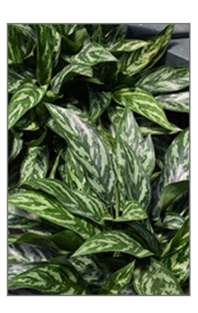
Tigress Chinese Evergreen foliage

Tigress Chinese Evergreen's attractive glossy pointy leaves remain olive green in colour with showy silver variegation throughout the year on a plant with an upright spreading habit of growth.