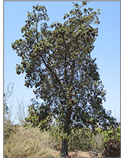
Santa Cruz Island Ironwood

This is a relatively low maintenance tree, and should only be pruned after flowering to avoid removing any of the current season's flowers. It is a good choice for attracting birds and squirrels to your yard, but is not particularly attractive to deer who tend to leave it alone in favor of tastier treats. It has no significant negative characteristics.