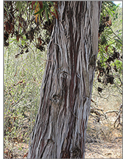
Santa Cruz Island Ironwood bark

This tree does best in full sun to partial shade. It prefers dry to average moisture levels with very well-drained soil, and will often die in standing water. It is considered to be drought-tolerant, and thus makes an ideal choice for xeriscaping or the moisture-conserving landscape. It is very fussy about its soil conditions and must have sandy, acidic soils to ensure success, and is subject to chlorosis (yellowing) of the foliage in alkaline soils, and is able to handle environmental salt. It is somewhat tolerant of urban pollution. This species is native to parts of North America.