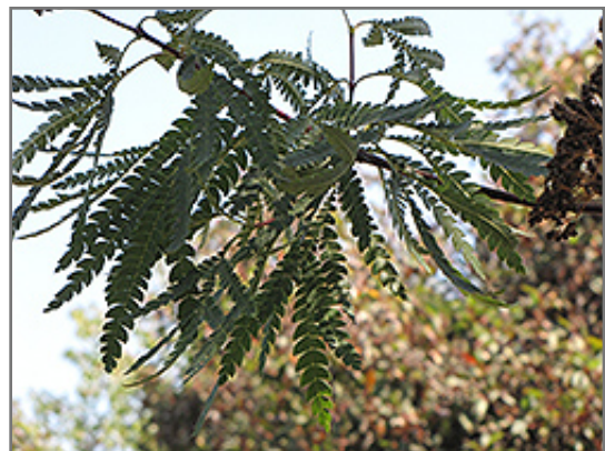
Santa Cruz Island Ironwood foliage