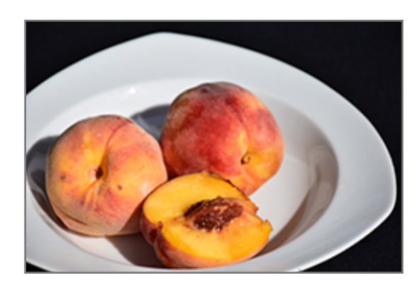
Sentry Peach fruit and flesh

A lovely fruit tree, bearing firm and juicy semi-freestone peaches; ornamental, with amazing pink flowers in spring; golden yellow fruit with scarlet blush gives way to sweet yellow flesh; ideal for fresh eating, grilling and baking