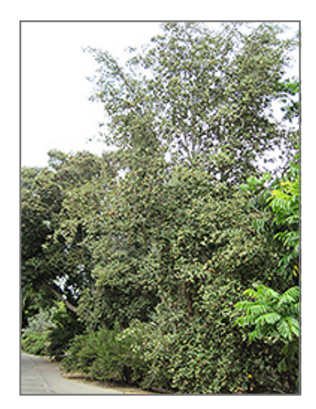
Primrose Tree

This is a relatively low maintenance tree, and should only be pruned after flowering to avoid removing any of the current season's flowers. It is a good choice for attracting bees, butterflies and hummingbirds to your yard, but is not particularly attractive to deer who tend to leave it alone in favor of tastier treats. Gardeners should be aware of the following characteristic(s) that may warrant special consideration;