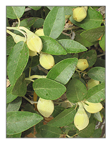
Primrose Tree fruit