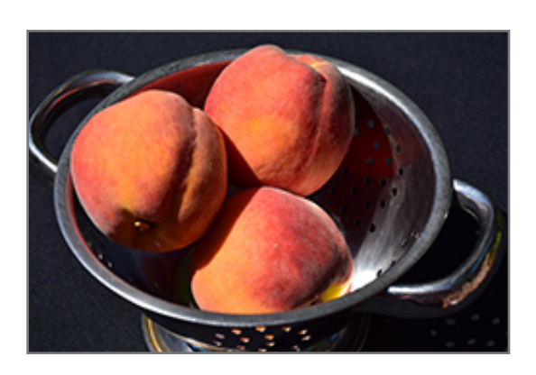
Flamin' Fury PF Big George Peach fruit

A late ripening selection featuring showy pink flowers in spring, followed by large, freestone peaches with excellent flavor and color for a late peach; very sweet and firm, perfect for baking, preserves, freezing and canning