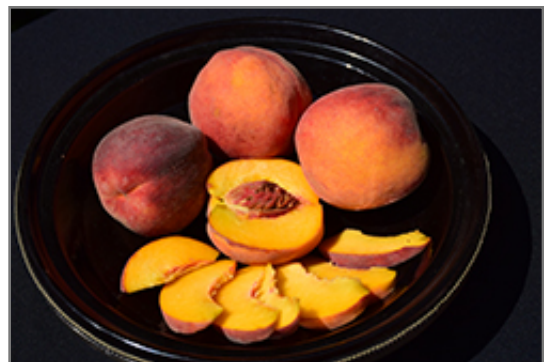
Coralstar Peach fruit and flesh