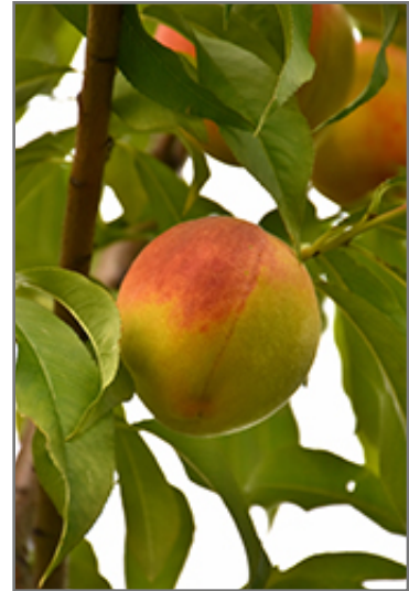
Coralstar Peach fruit