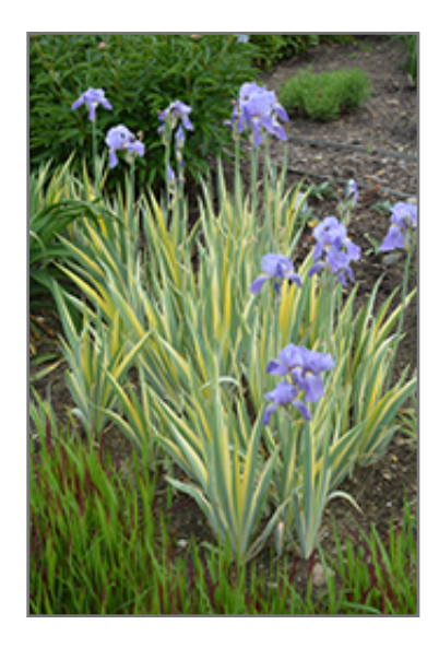
Silver-variegated Sweet Iris in bloom

This plant will require occasional maintenance and upkeep, and should be cut back in late fall in preparation for winter. Deer don't particularly care for this plant and will usually leave it alone in favor of tastier treats. Gardeners should be aware of the following characteristic(s) that may warrant special consideration;