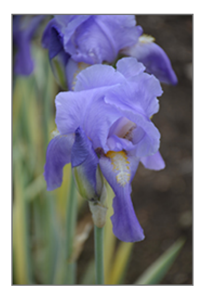
Silver-variegated Sweet Iris flowers