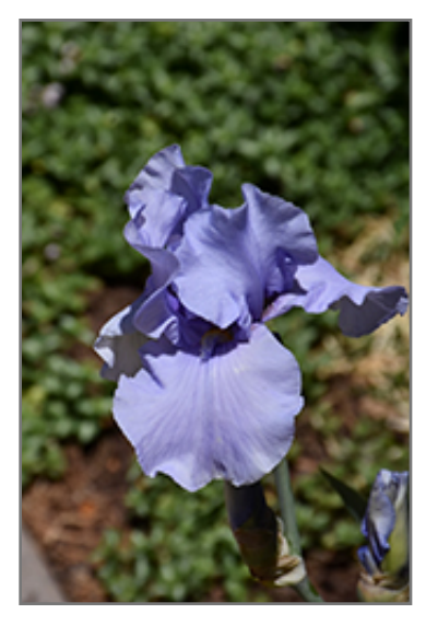
Pacific Mist Iris flowers