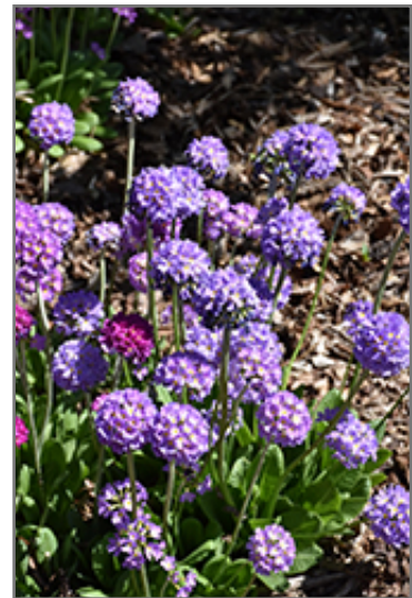
Drumstick Primrose in bloom