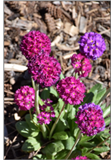
Drumstick Primrose flowers