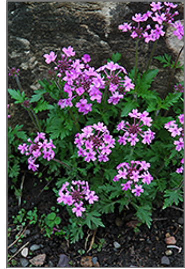
Drumstick Primrose in bloom

This plant does best in partial shade to shade. It does best in average to evenly moist conditions, but will not tolerate standing water. It is not particular as to soil type or pH. It is somewhat tolerant of urban pollution, and will benefit from being planted in a relatively sheltered location. Consider covering it with a thick layer of mulch in winter to protect it in exposed locations or colder microclimates. This species is not originally from North America.