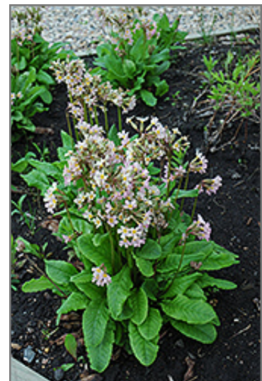
Cortusa Primrose in bloom