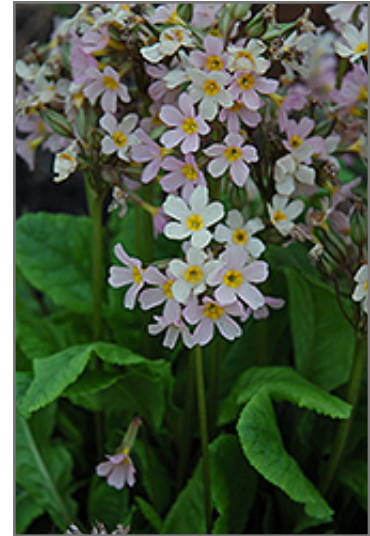
Cortusa Primrose flowers