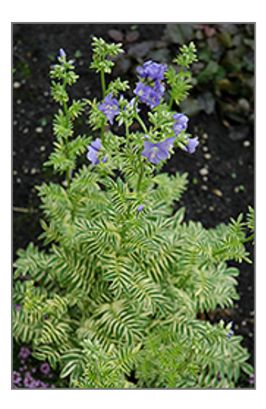
Brise D'Anjou Jacob's Ladder in hloom

Brise D'Anjou Jacob's Ladder has masses of beautiful spikes of sky blue flowers rising above the foliage from mid spring to mid summer, which are most effective when planted in groupings. The flowers are excellent for cutting. Its attractive ferny pinnately compound leaves remain green in colour with showy creamy white variegation throughout the season.