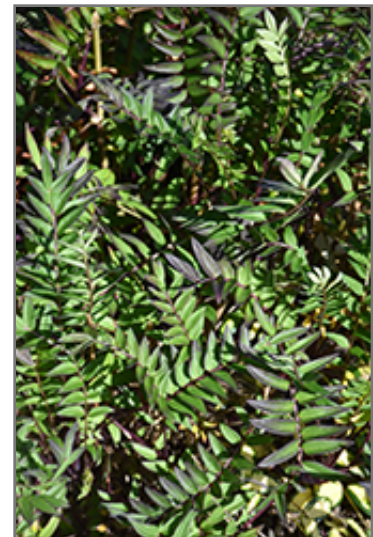
Bressingham Purple Jacob's Ladder foliage