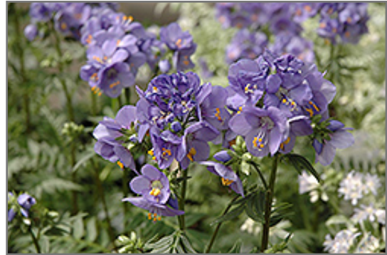
Bressingham Purple Jacob's Ladder flowers