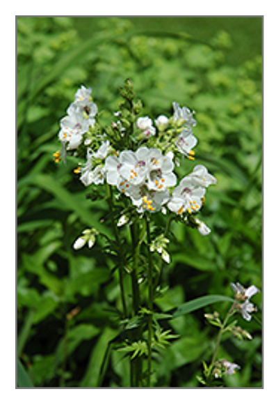
White Jacob's Ladder flowers

White Jacob's Ladder has masses of beautiful spikes of white flowers rising above the foliage from mid spring to mid summer, which are most effective when planted in groupings. The flowers are excellent for cutting. Its ferny pinnately compound leaves remain green in colour throughout the season.