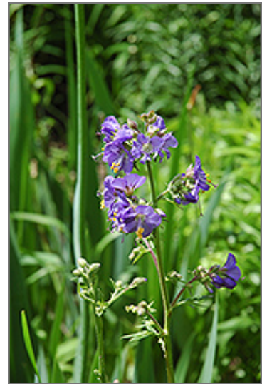
Common Jacob's Ladder flowers