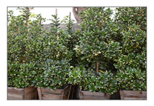
Variegated New Zealand Laurel (topiary form)

This is a relatively low maintenance tree, and usually looks its best without pruning, although it will tolerate pruning. It has no significant negative characteristics.