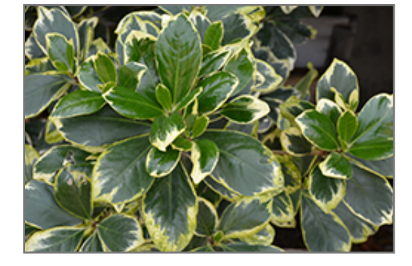
Variegated New Zealand Laurel foliage

Variegated New Zealand Laurel is an evergreen tree with an upright spreading habit of growth. Its relatively coarse texture can be used to stand it apart from other landscape plants with finer foliage.