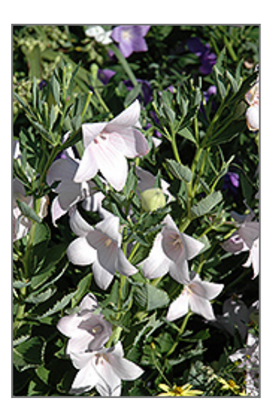
Hakone White Balloon Flower flowers

Hakone White Balloon Flower has masses of beautiful spikes of semi-double white bell-shaped flowers rising above the foliage from early to late summer, which emerge from distinctive sky blue flower buds, and which are most effective when planted in groupings. The flowers are excellent for cutting. Its narrow leaves remain dark green in colour throughout the season.