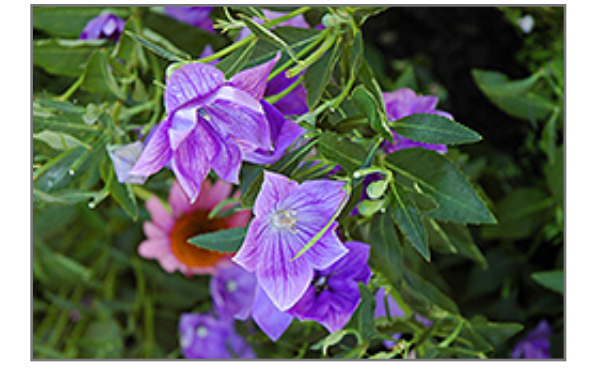
Hakone Blue Balloon Flower flowers