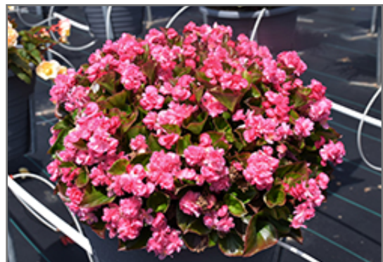
Double Up Pink Begonia in bloom